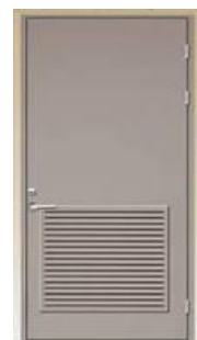
LOUVER PANEL BRAND: UAE & CHINA