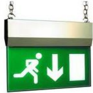
FIRE EXIT SIGN BRAND: LOCAL & CHINA