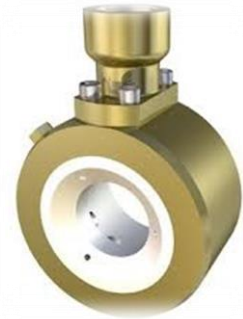
FOAM PROPORTIONER BRAND :USA,CHINA & UAE