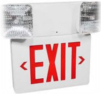
EMERGENCY EXIT WITH LIGHT BRAND: LOCAL & CHINA