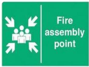
FIRE ASSEMBLY SIGN BRAND: LOCAL & CHINA