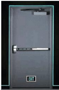
FIRE EXIT DOOR BRAND: UAE & CHINA