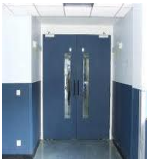
DOUBLE DOOR W/VIEW GLASS, BRAND: UAE & CHINA