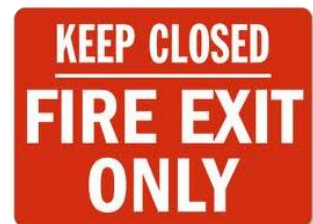
EXIT ONLY SIGN BRAND: LOCAL & CHINA