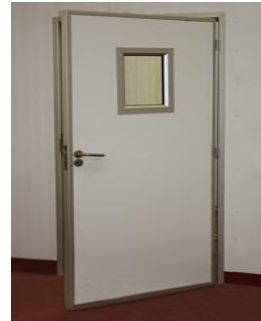
SINGLE WITH VISION PANEL BRAND: UAE & CHINA