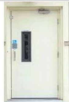
SINGLE WITH VIEWING GLASS BRAND: UAE & CHINA