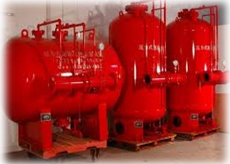
BLADDER TANK BRAND :USA,CHINA & UAE