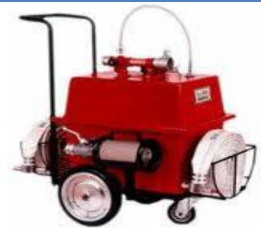
FOAM UNIT BRAND :USA, CHINA & UAE