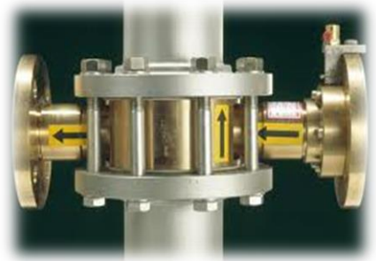
HYDRAULIC CONC. VALVE BRAND :USA, CHINA & UAE