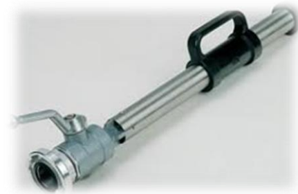
HEAVY NOZZLE BRAND :USA, CHINA & UAE