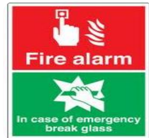
FIRE ALARM SIGN BRAND: LOCAL & CHINA