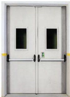
DOUBLE WITH VISION PANEL BRAND: UAE & CHINA