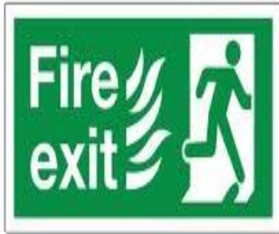
FIRE EXIT SIGN BRAND: LOCAL & CHINA