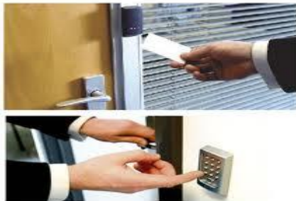
Entry Control Units