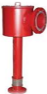
FOAM CHAMBER BRAND :USA, CHINA & UAE